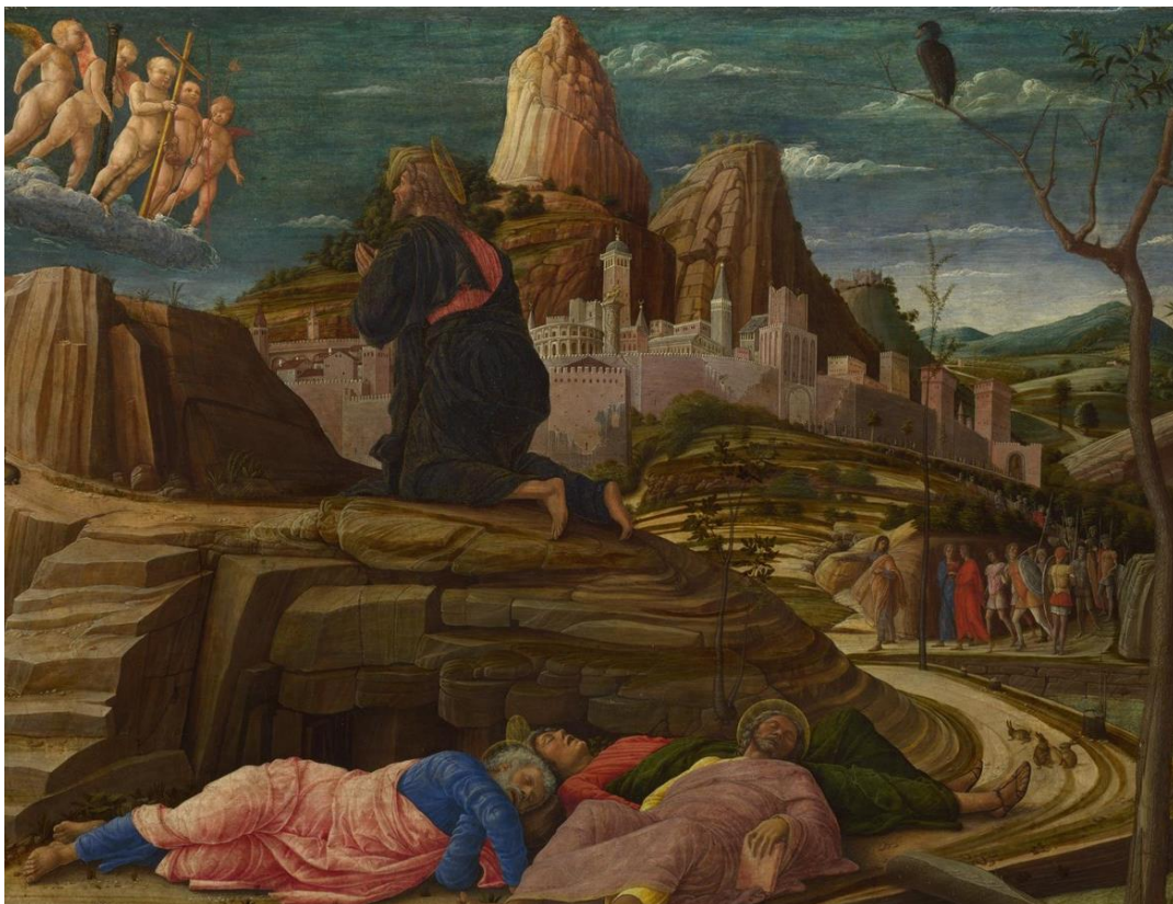
Picture: The Agony in the Garden, Andreas Mantegna, c. 1460

Time is left for private prayer. At the end these words may be read. When the disciples had sung a hymn they went out to the Mount of Olives. Jesus prayed to the Father, 'If it is possible, take this cup of suffering from me.' He said to his disciples, 'How is it that you were not able to keep watch with me for one hour? The hour has come for the Son of Man to be handed over to the power of sinners.' Christ was obedient unto death. Go in his peace.